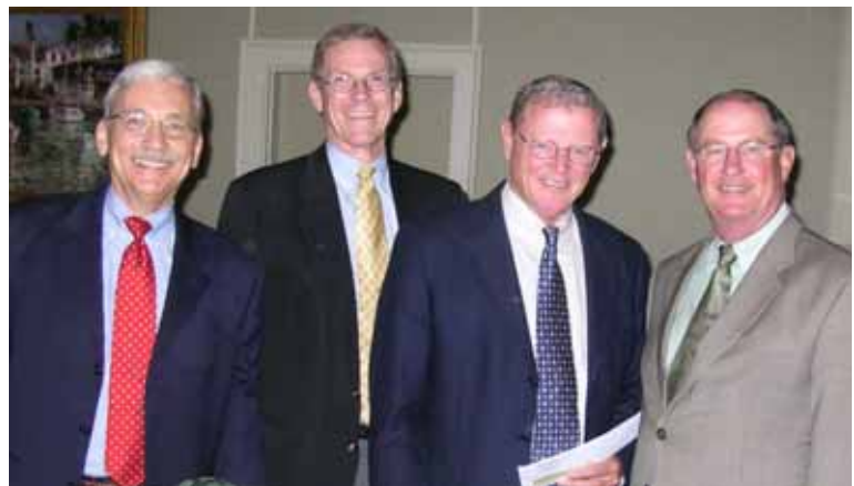
Jim Benson, Steve Ford, Senator Inhofe, Jim Sullins

Discussions also included the re-authorization of SAFETEA-LU in 2009, and, water and wastewater infrastructure issues in which the Senator is including QBS language.